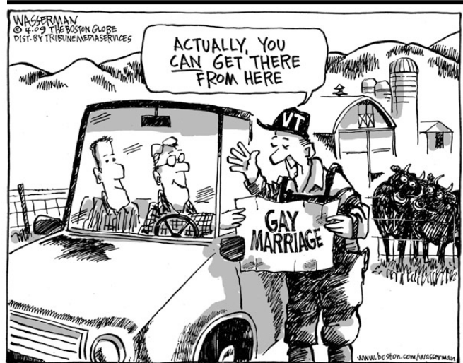
Online cartoon in the Boston Globe on 4/7/09 VT decision.